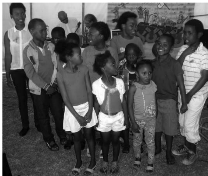
Left - Children from James Calata chapelry who sang at the Haven celebration service.