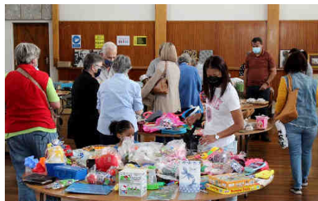
Some of the people who were buying items on sale at St Hugh's.

With the opening up of facilities to Level 1 of COVID Protocols, St Hugh's decided to have a sale of goods.